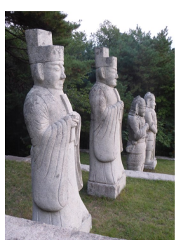
1st November North Korea - Grenades in the Schoolyard We see rarely visited parts of this most secretive country